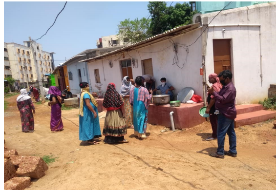
To Street Beggars / Street Vendors